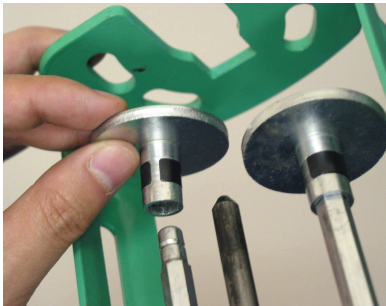
Patented Snap In/Snap Out Push Disks

EASY CONVERSIONS NO DISASSEMBLY REQUIRED