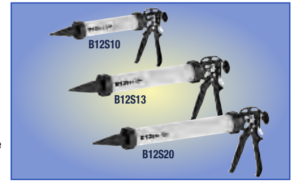
(for high-end professional tools see our website)

Model B18S20— (18:1 thrust ratio) all the features of the B12S20 with high-thrust drive Models B26S20/B26S10— (26:1 thrust ratio) for highest-viscosity materials and the demands of cold weather use